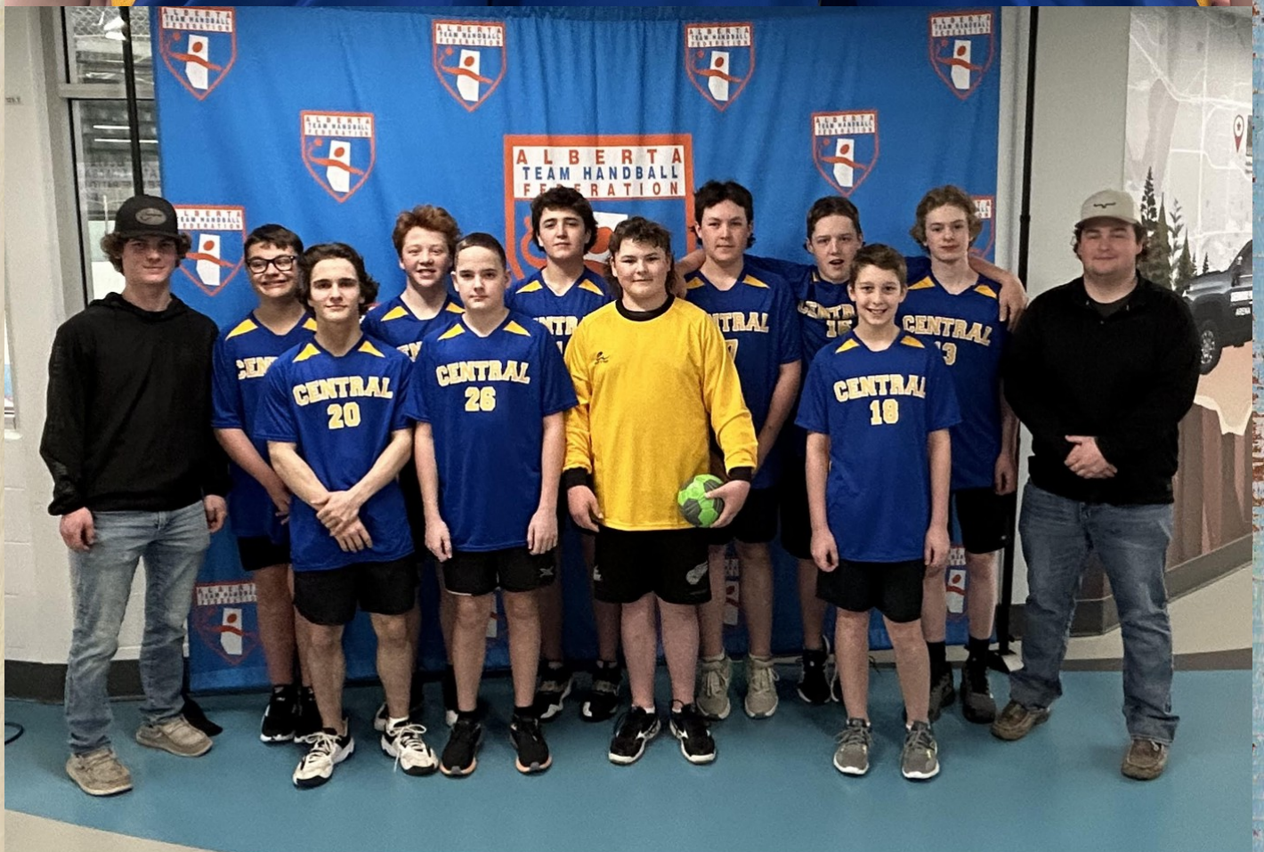
We have a few KPS students playing handball with CHSPS. Good luck to our teams at Provincials in Sherwood Park. We already had reports that the boys won their first game!! Good job everyone!!