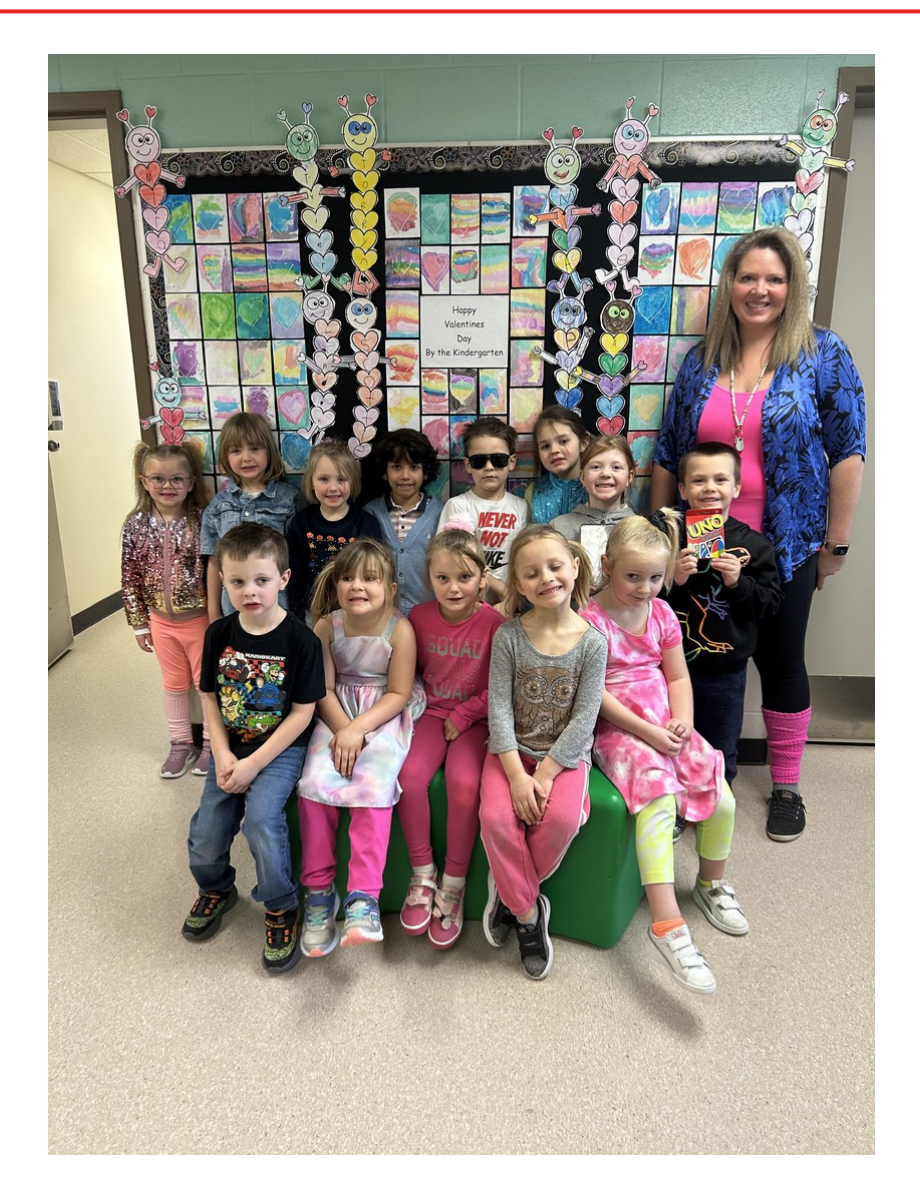
80's Day at KPS - Kindergarten showing their 80's spirit!