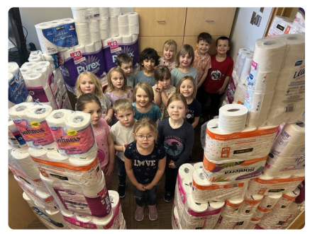
The fort was so big we could get all the