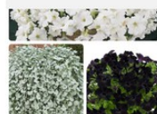
Black & White Mix