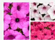
Cheery Pink Mix